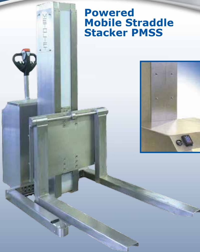
Powered Mobile Straddle Stacker PMSS