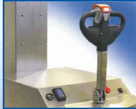
Powered Mobile Pallet Jack PMPJ